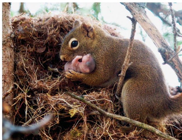
Figure 1 | Female red squirrel prepares to move a juvenile between nests.

Cases of adoption. During detailed study of red squirrels at a single site over the past 19 years (2,230 litters), we have detected five instances of adoption (a lactating dam nursing another dam's juvenile until weaning), for which we knew the ancestry of the dam and the adopted juvenile. These adoptions occurred in different years with different females, but always involved the adoption of kin (Table 1). Four adoptions occurred when the juveniles were between 43 and 63 days old. The individuals (identified by unique ear tags) were seen nursing from and/or nesting with the surrogate dam and her offspring. Nest emergence occurs between 42 and 65 days of age, whereas weaning occurs at 70 days of age 12,13 . The fifth adoption was detected when we entered a nest to find one juvenile that was unusually large relative to its littermates (20.6 vs. 13.7 g \pm 0.7 s.e.m.). The mass, sex and presence of an ear notch (juveniles are marked with